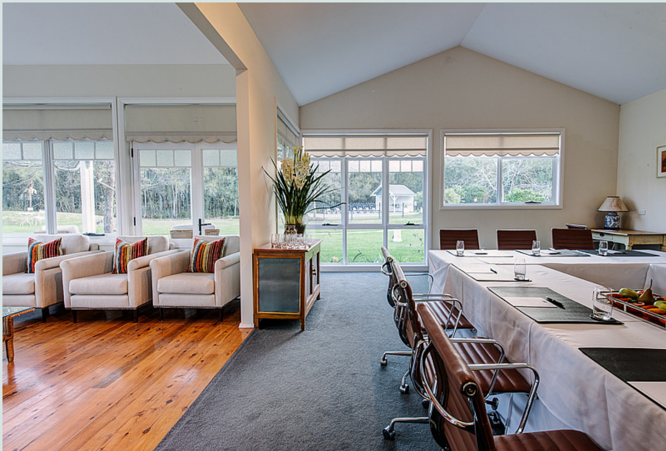
The Brigidine Room

Sq m: 40 Cocktail: 50 Boardroom: 20 Theatre: 40 Banquet: 30 Classroom: 30 U-shape: 20