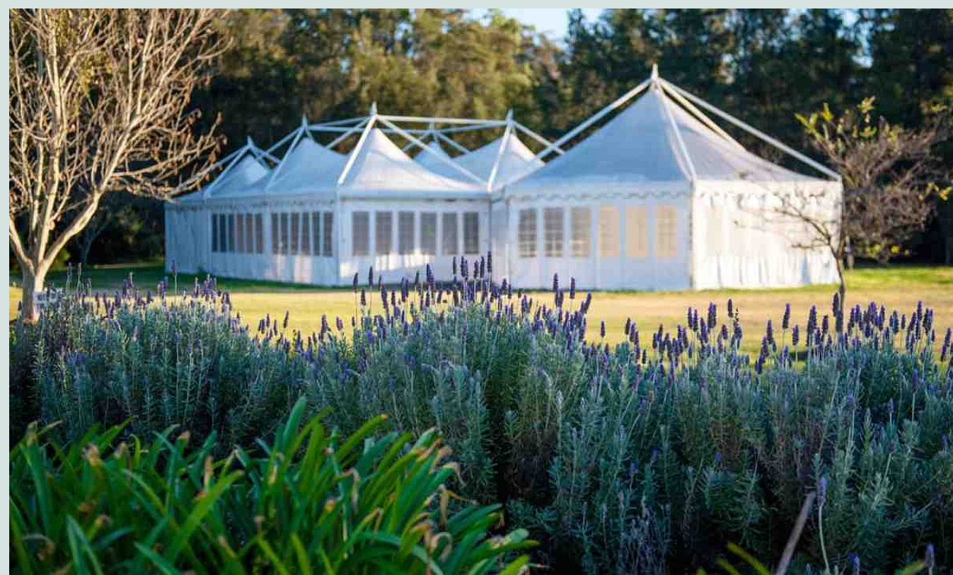
The Grand Marquee

Sq m: 55 Cocktail: 70 Boardroom: 25 Theatre: 60 Banquet: 50 Classroom: 40 U-shape: 25