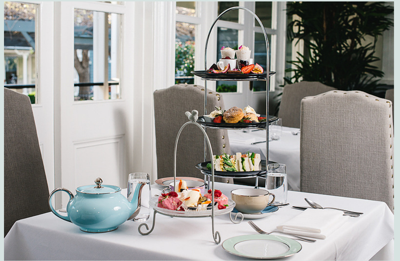
Restaurant Eighty Eight

Sq m: 40 Cocktail: 50 Boardroom: 20 Theatre: 40 Banquet: 30 Classroom: 30 U-shape: 20